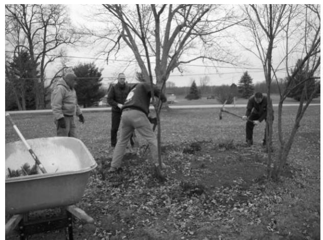
NLCI Volunteers clear the way for the new garden

The garden is a project of a new seedling chapter of Wild Ones, a native plant organization that works towards educating the public on the importance of native plants and encouraging their use in local landscapes. The chapter teamed up with the Brunswick area Girl Scouts, Brunswick Area Historical Society, City of Brunswick and the Rocky River Watershed Council to plant this pollinator garden.